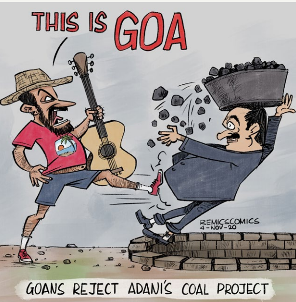
A cartoonist’s take on the conflict concerning new coal infrastructure in and around the port of Goa.