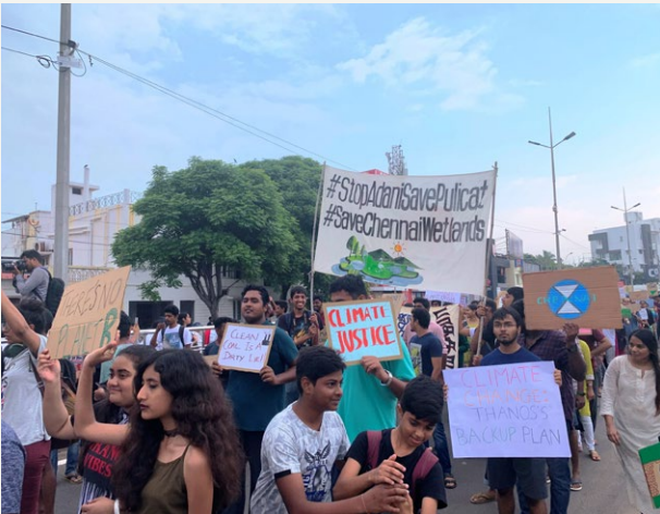
Protesters oppose Adani’s proposal to massively expand the Kattupalli port near Chennai.