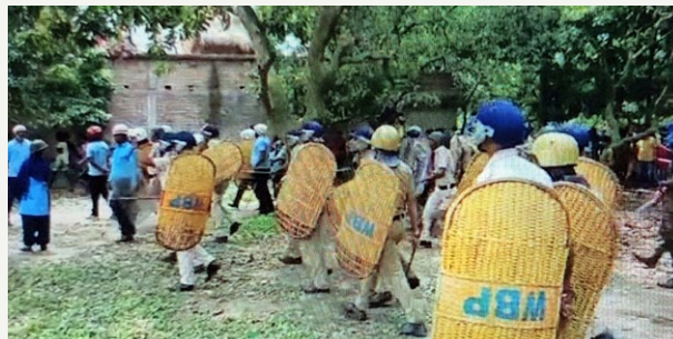
Police with shields and batons move in on protesting orchardists defending their fruit trees from an Adani transmission line, July 2022.

Community leaders have alleged murder plots against them, as well as fabricated charges by the police.