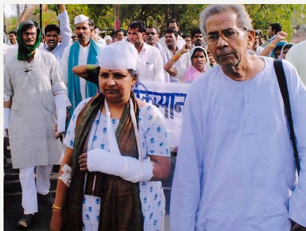
Community leaders injured by pro-Adani goons march against Adani's proposed Pench coal-power station.