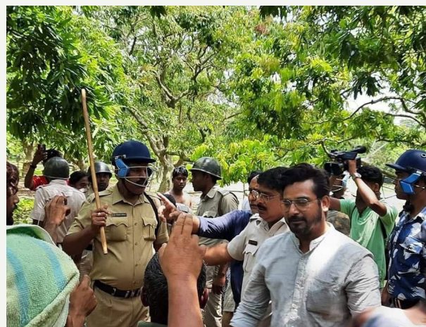
A confrontation occurs between police and orchardists amongst fruit trees threatened by an Adani transmission line in West Bengal, July 2022.