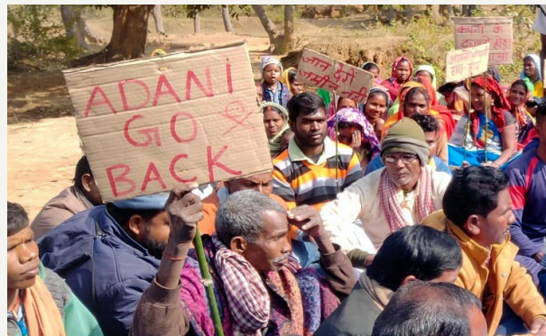
Residents of one of the villages threatened by Adani's Gondalpara (sic) mine protest in defence of their lands and livelihoods.

Villagers have so far out-manoeuvred Adani and the state in their attempts to hold the meetings necessary for the approvals process.