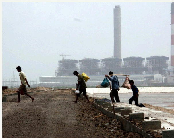
Traditional indigenous inhabitants of fishing communities traversing a coastline damaged and polluted by Adani's coal-power plants at Mundra, Gujarat, India.