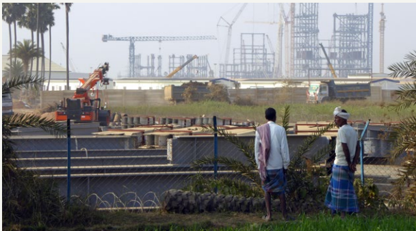
Adivasi (indigenous tribal) farmers survey construction of the Godda coal-power plant, February 2020.