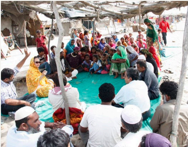
Members of a fishing community in the Mundra area voice their concerns about the port’s impacts on marine ecology and fish stocks.