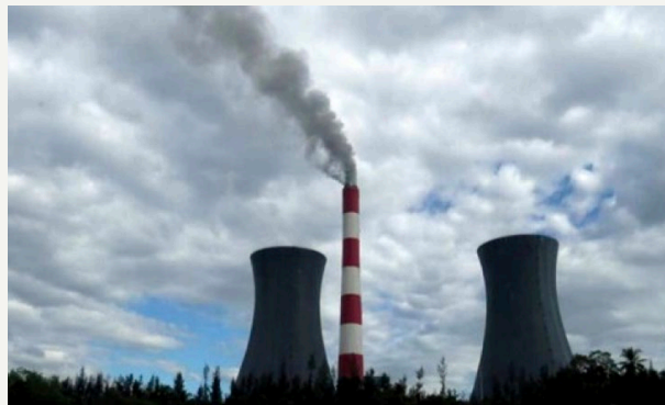
Smoke from Adani's Udupi power station, Karnataka, India.

Local people have attributed a reduction in crop yields and an increased incidence in respiratory-tract diseases to pollution from the plant; a survey indicates that over 90% of those surveyed oppose a planned expansion of the Udupi power plant.