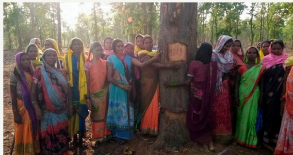
Adivasi (indigenous tribal) women block tree-cutting operations for the proposed expansion of the Adani-operated PEKB coal mine, Chhattisgarh, India.

In 2022, the community mounted peaceful direct-action protests against works to expand the PEKB mine. In June 2022, the state government said that works are 'on hold', but subsequently tree-felling resumed for the PEKB extension.