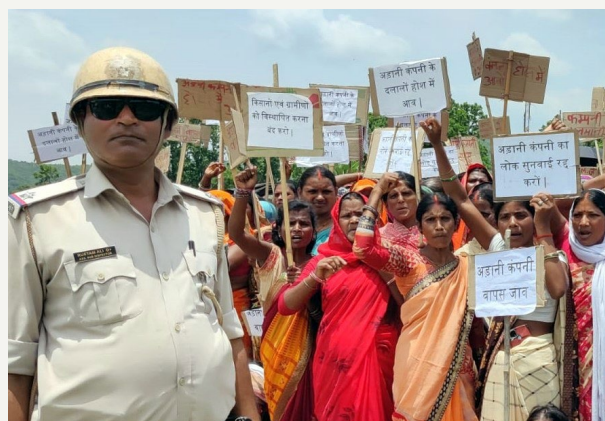
Armed security forces have attended protests by villagers defending their land at Gondalpara.