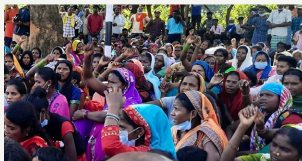
Adivasi (indigenous tribal) people rally before marching over 300km to the state capital in October 2021 to protest at proposed coal mines in the Hasdeo forests, Chhattisgarh, India.