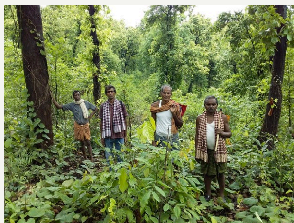
Adivasi (tribal) inhabitants of the Talabira area in the threatened forests on which they depend.

Talabira I is disused but its waste degrades adjacent farms, leading to a community petition to the National Green Tribunal and a fine against the Adani company concerned.