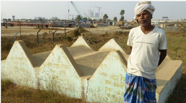
An Adivasi (indigenous tribal) farmer at the graves of family members - over the fence, Adani’s giant Godda coal-power plant takes shape, February 2020.