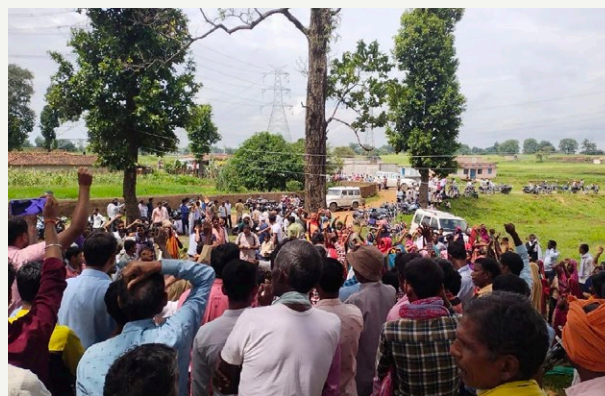
The community of Dhirauli rallies against the proposed coal mine in the district of Singrauli.