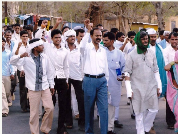
People in the Chhindwara area of Madhya Pradesh march against Adani's proposed Pench coal-power plant, 2011.

The business case for the project has been questioned . In 2021, desperate farmers reoccupied and cultivated land on the Pench project site. The legality of land acquisition for the Pench power project has been questioned.