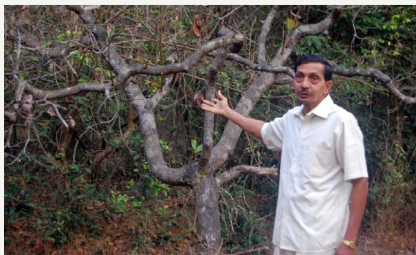
A farmer stands next to a dying orchard of mango trees, affected by pollution from the Udupi power plant.