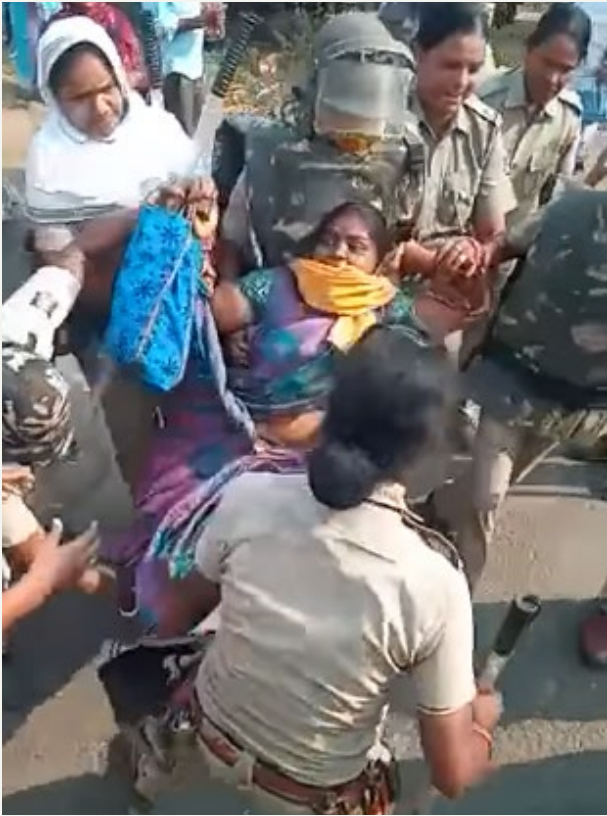
A protesting Adivasi woman receives rough treatment at the hands of police in a protest against a railway expansion to facilitate transport of Adani's coal from the port of Dhamra to the power station at Godda.